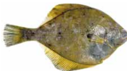
Figure 17 Limanda aspera