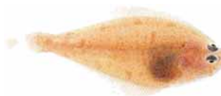
Figure 15 Hippoglossoides robustus