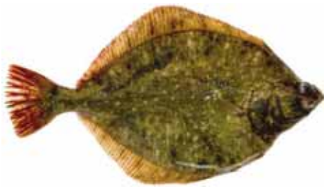
Figure 18 Pleuronectes quadrituberculatus