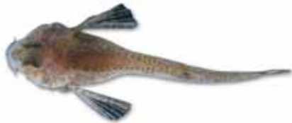
Figure 20 Ulcina olrikii