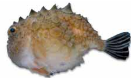
Figure 29 Eumicrotremus orbis