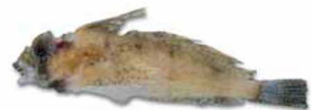
Figure 30 Nautichthys pribilovius