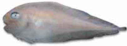
Figure 31 Careproctus reinhardtii