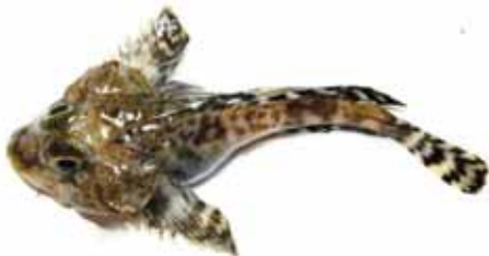
Figure 21 Artediellus atlanticus