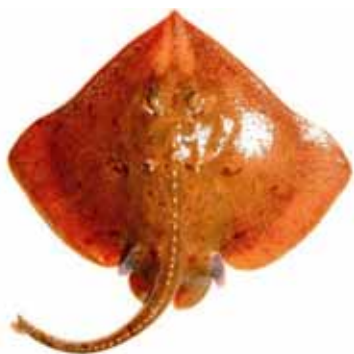
Figure 2 Bathyraja parmifera