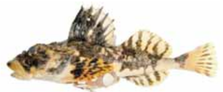
Figure 27 Myoxocephalus scorpius