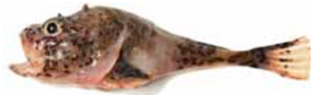
Figure 36 Cottunculus microps