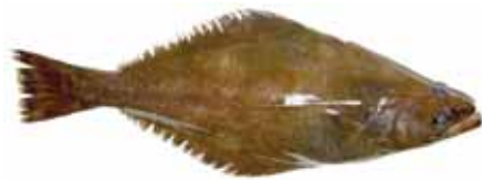
Figure 19 Reinhardtius hippoglossoides