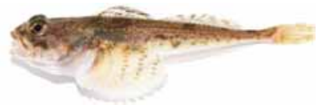
Figure 24 Gymnocanthus tricuspis