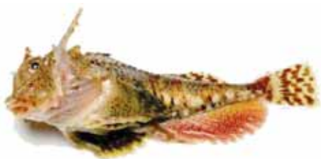
Figure 23 Enophrys diceraus