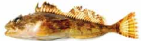
Figure 25 Hemilepidotus papilio