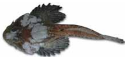
Figure 22 Artediellus scaber