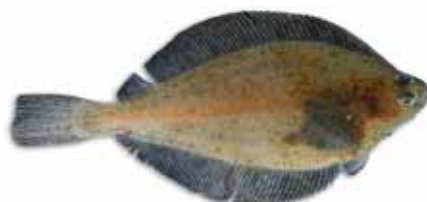
Figure 16 Lepidopsetta polyxystra