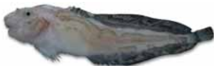
Figure 35 Liparis tunicatus